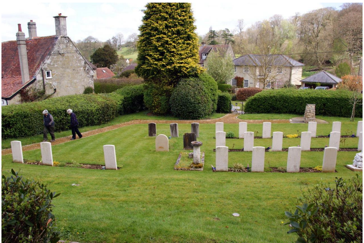
Photo taken from back of Cemetery looking towards the Entrance