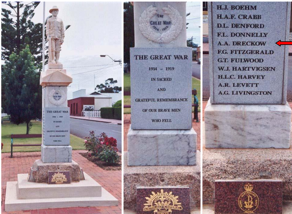
Cleve War Memorial