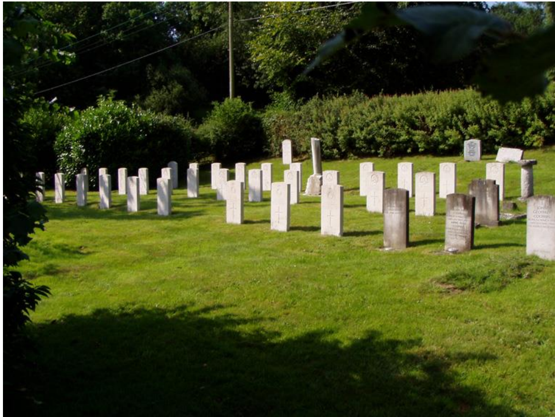
Compton Chamberlayne War Graves